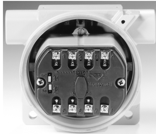
Figure 1 – STT350 Transmitter in field mount housing. The Model STT35F is identical in size but details vary.

For the STT35F, the output conforms to the low speed (H1) of the Fieldbus Physical Layer specification IEC 1158-2 (1993). The other protocol layers conform to the FOUNDATION™ Fieldbus which is supported by all the worldwide instrumentation suppliers and enables multidrop field instruments to be powered down a single wire pair and communicate measurement, control, configuration and diagnostic data at 31.25kbps.